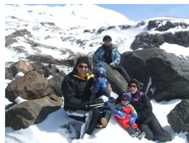
Family friendly lodge Oct 2010.