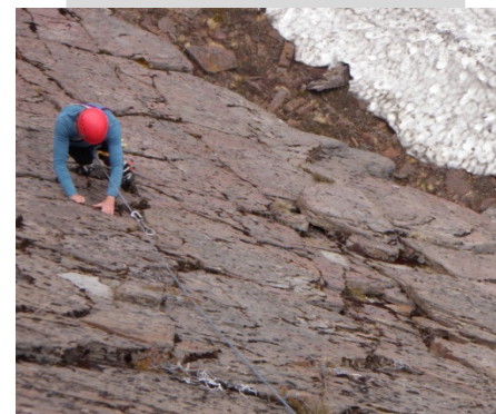
NZAC Wellington putting up new rock routes- November 2010

We are looking for someone with marketing/promotion experience to help us get the word out about our new facility. If this is you, contact marketing@tukinoalpinesportsclub.org.nz